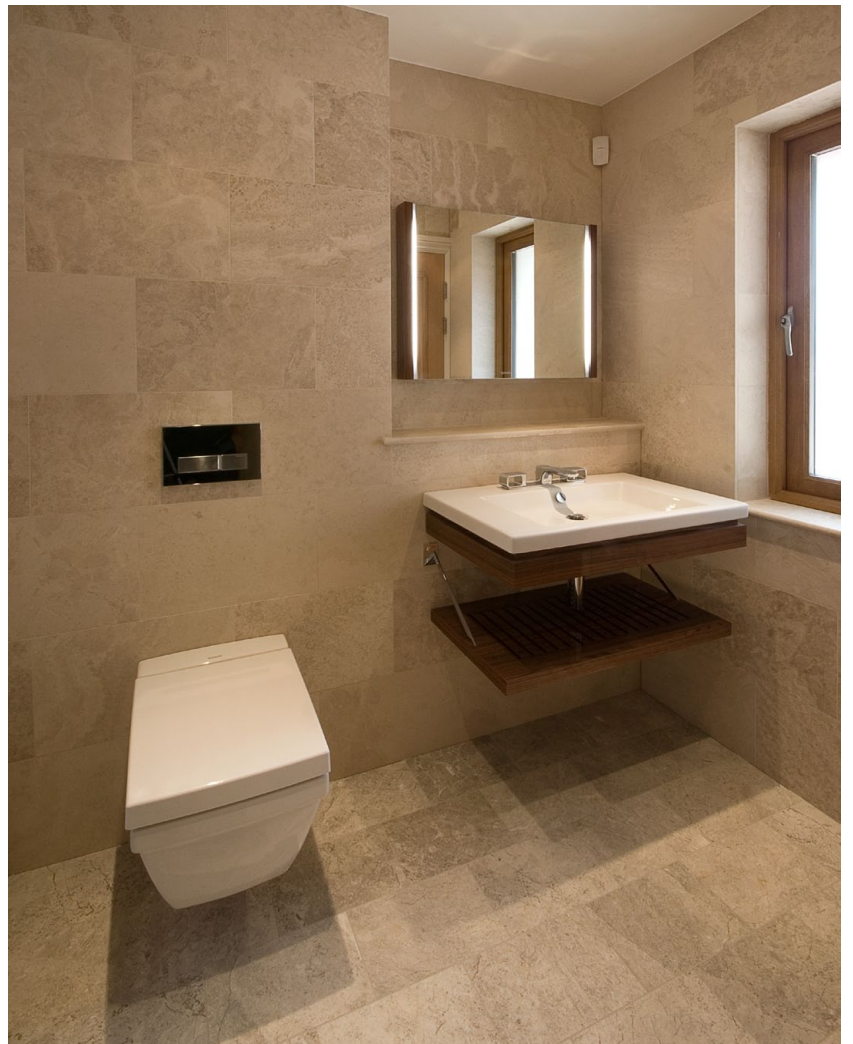
Right: Apollo Ankulos honed wall tiling paired with Orion honed marble flooring 600x400mm tiles.