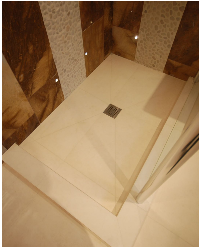
Above: Another use of Gaia marble to create a feature against the Artemis limestone.