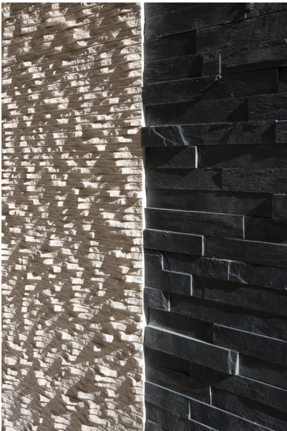
Close up details of the chisel cut Apollo limestone and split face grey slate.