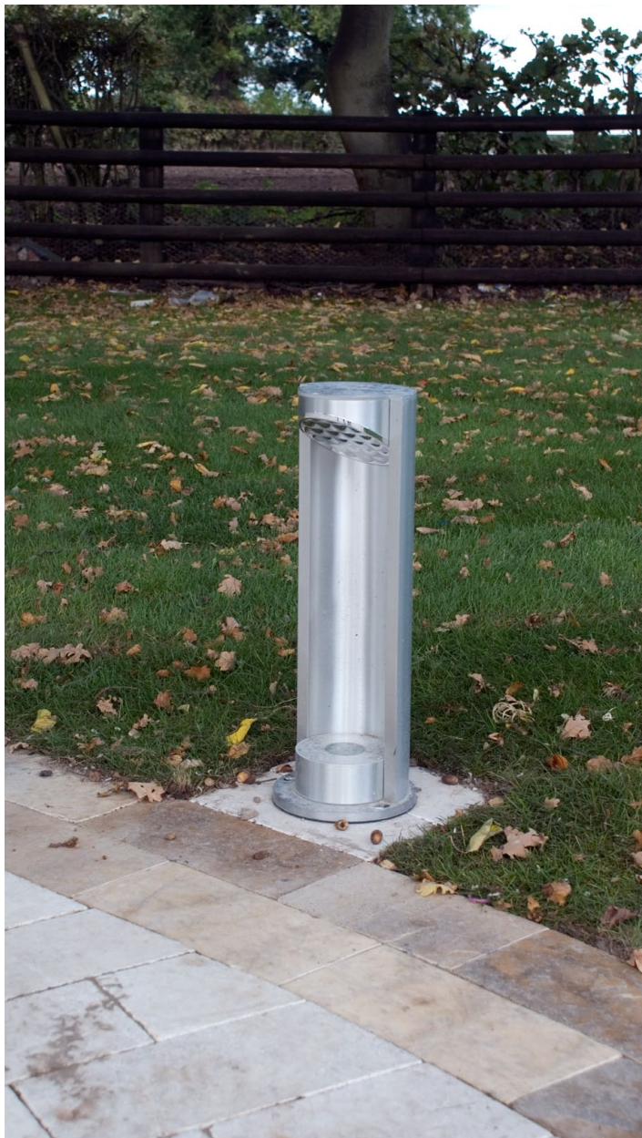
Custom lighting design incorporated into the Hera Marble driveway paving bordered with contrasting Gaia Marble.

This selection of outdoor areas surrounding Stable Cottage demonstrates the best in contemporary design featuring a variety of GOSS marble and limestone.