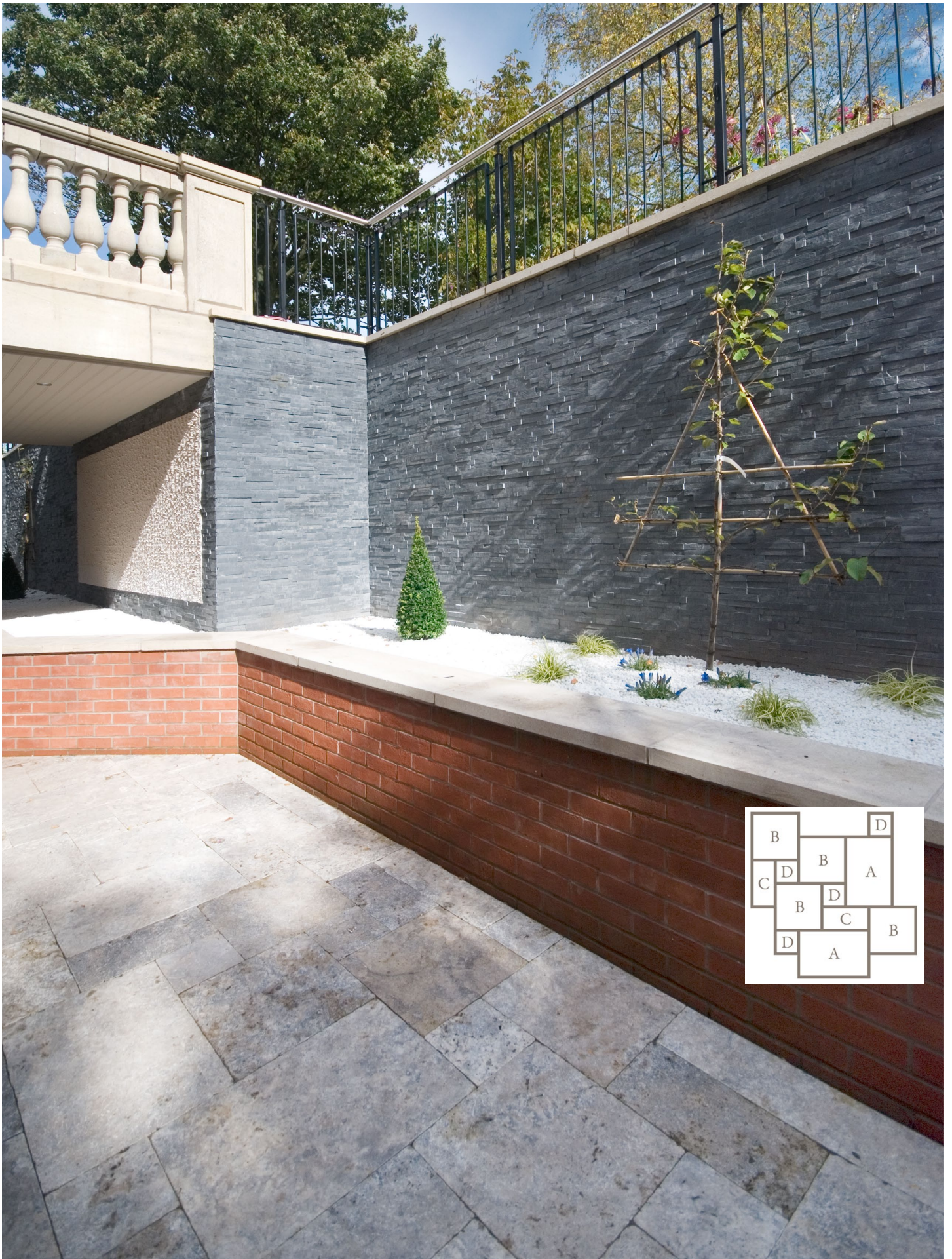
The outer basement level flooring of Stable Cottage uses the GOSS Marble Hyperion Opus pattern of sawn cut Eurys silver travertine for a non slip finish.