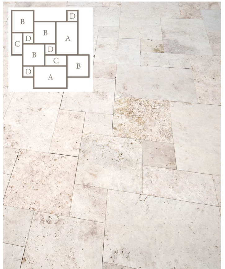
A detailed view of the Hyperion Opus pattern which is used to surround the outside of Stable cottage.